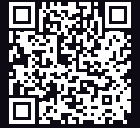
RUT200 360° VIEW